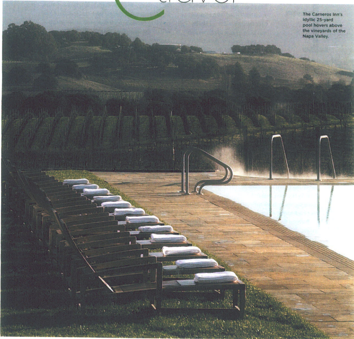
The Carneros Inn's idyllic 25-yard pool hovers above the vineyards of the Napa Valley.