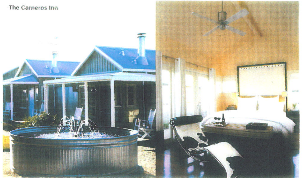
The Carneros Inn

“Beaches aside, the fabled Hamptons of New York's Long Island really have nothing on this enchanting valley.”