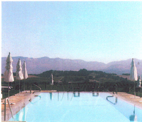
Above: The pool at The Carneros Inn offers panoramic views of the resort's 27 acres of lush farmland. Below: A gas fireplace, flat-screen TV, deep soaking bathtub and minimalist decor make the couple's Gaige House suite a most romantic retreat.

Halfway through the trip, the pair drove to Sonoma and checked into an Asian-inspired room at Gaige House, where the flavorful gourmet breakfasts led to many Zen moments. Though they had made reservations at most wineries, a bottle of locally produced pinot gris at chef Charlie Palmer's restaurant, Dry Creek Kitchen, inspired an unplanned visit to J Vineyards & Winery. After selecting more bottles to be shipped back home, the couple spent a final night in San Francisco, toasting their good taste in travel. —Elaine Stuart