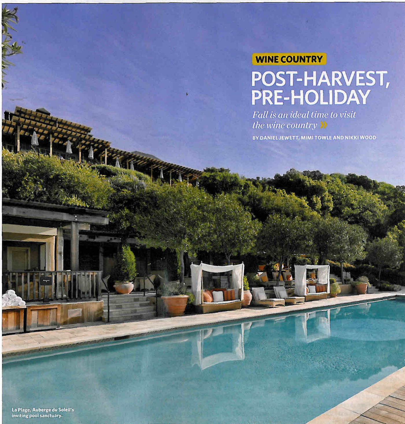
La Plage, Auberge du Soleil's inviting pool sanctuary.

BY DANIEL JEWETT, MIMI TOWLE AND NIKKI WOOD